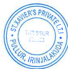
PRINCIPAL ST.XAVIER'S PRIVATE I.T.I PULLUR - 680683, KERALA

conducted by this Training Institute held from October 2018 to March 2019