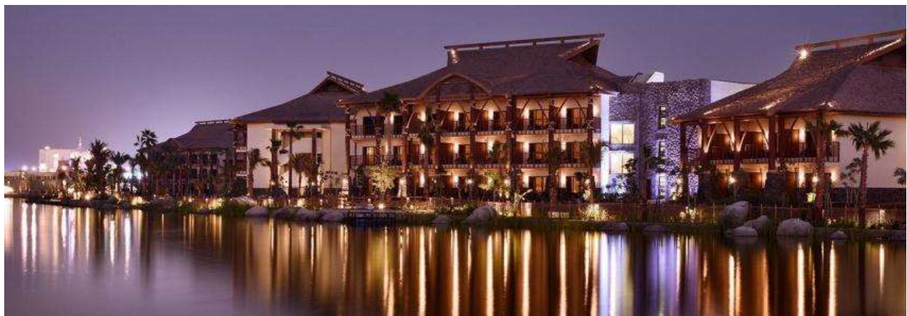
Project: Hotel Lapita, Dubai Parks & Resorts, Dubai

Client: Gulf Resources Development and Investment LLC (GRDI) Lead Consultant: Conin Consultant Lead Architect: Broadway Malyan & Foreman Roberts MEP Engineer: Conin Consultant Main Contractor: Multiplex Construction LLC