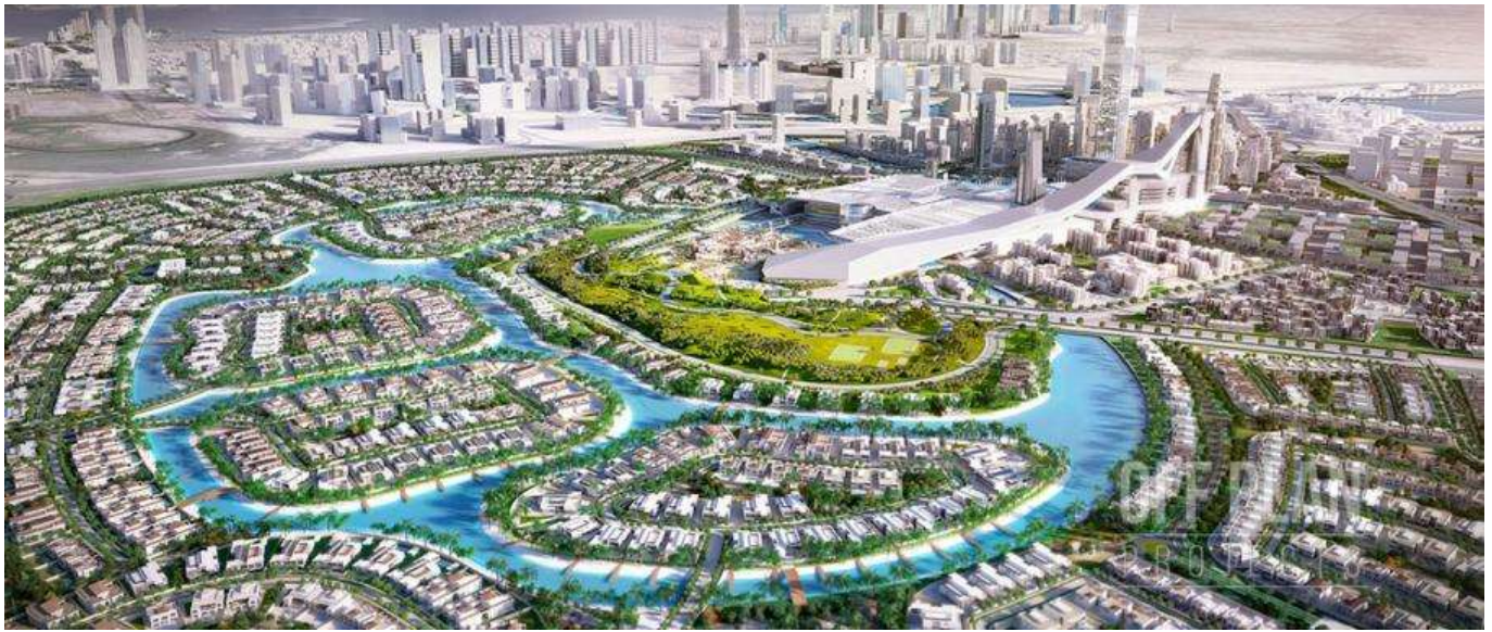
Project: Mohammed Bin Rashid Al Maktoum City, District One, Dubai

This Phase will include Motiongate, Bollywood Parks, Legoland, Lapita Hotel, Retail, Dining and Entertainment Central Park and Lagoon as well as the Infrastructure and common back-of-house facilities