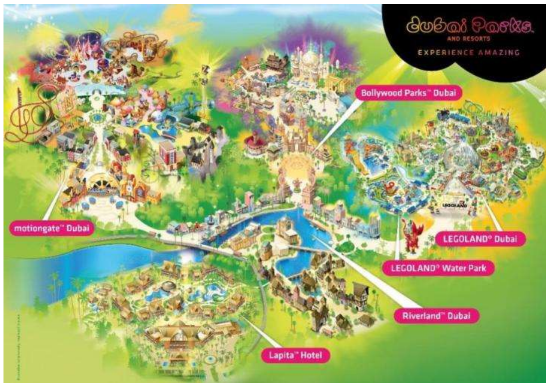
Project: Dubai Parks & Resorts, Dubai

Company Name: Ramtech Corporation, Dubai