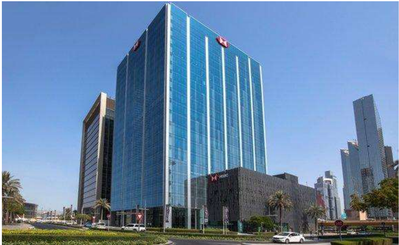
Project: HSBC Headquarters, Emaar Square, Downtown, Dubai

Basment-03 + Ground Floor + Podium-04 16 Floor - Commercial Storey Building Model detailing up to LOD 300